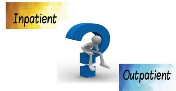
Inpatient Vs Outpatient Coding

Answer (continued): For those seeking to identify Massachusetts inpatient acute care hospitals the APCD, the highest version of following fields can be used: